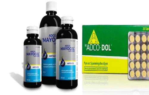
Adco-dol OTC Pain relief