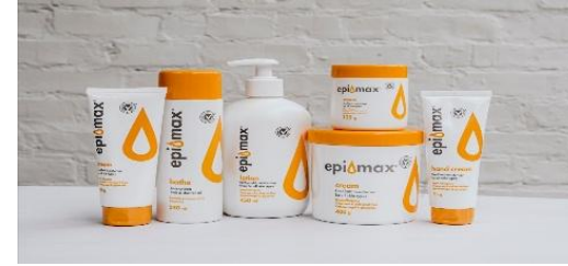
Epi-max Consumer Emollient