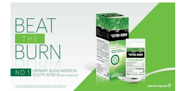
Citra-Soda OTC Antacid