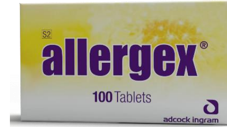
Allergex OTC Anti-Allergic