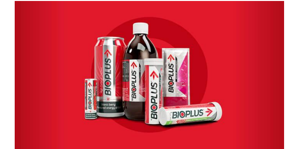
Bioplus Consumer Multi-Vit Energy Booster