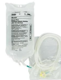
Dianeal Solution Hospital Dialysis solution