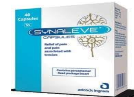
Synaleve Prescription Pain relief