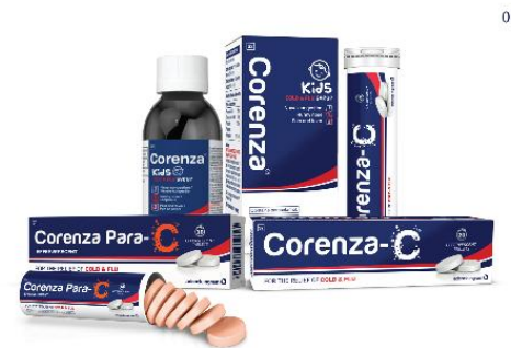
Corenza C OTC Cold & Flu