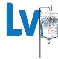
IV Solutions Viaflex Hospital NaCl solution