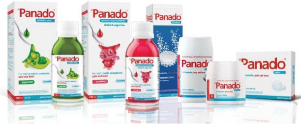
Panado Consumer Analgesic